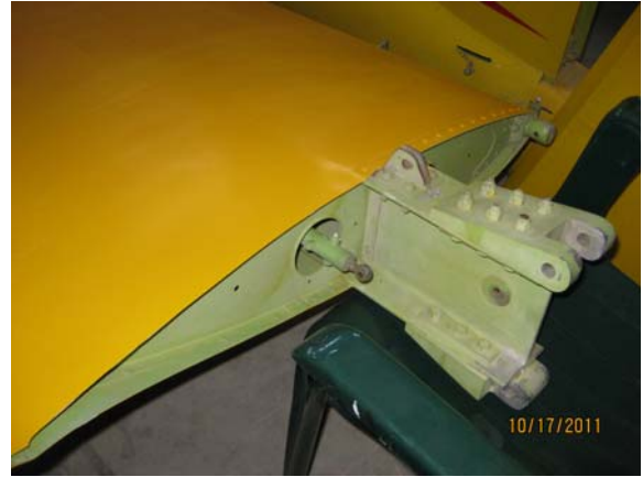
Spar attachment for the SS-1.

Maximum glide ratio: 30:1 at 60 mph Rate of sink: 2.3 ft/s at 60 mph Wing loading: 5.7 lb/sq ft